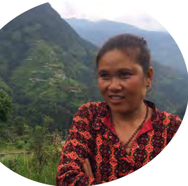
↑ Durna’s wife

CBM Global is supporting projects in Nepal that assist communities to adapt farming approaches to climate change. Our work helps set up self-help and savings groups that include both people with and without disabilities, and supports people with disabilities to develop vocational skills that will enable them to move out of poverty.