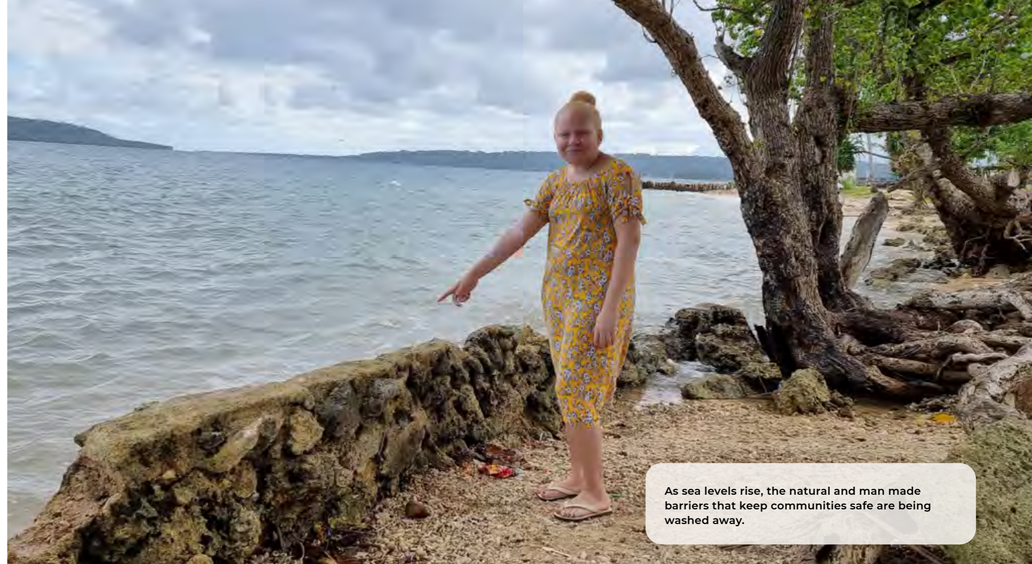
As sea levels rise, the natural and man made barriers that keep communities safe are being washed away.

CBM Global is supporting an organisational strengthening program with the Vanuatu Disabled People's Association (VDPA), which is supporting them to be able to work with government and other organisations responding to climate change, and make sure the perspectives and issues faced by people with disabilities are not overlooked.