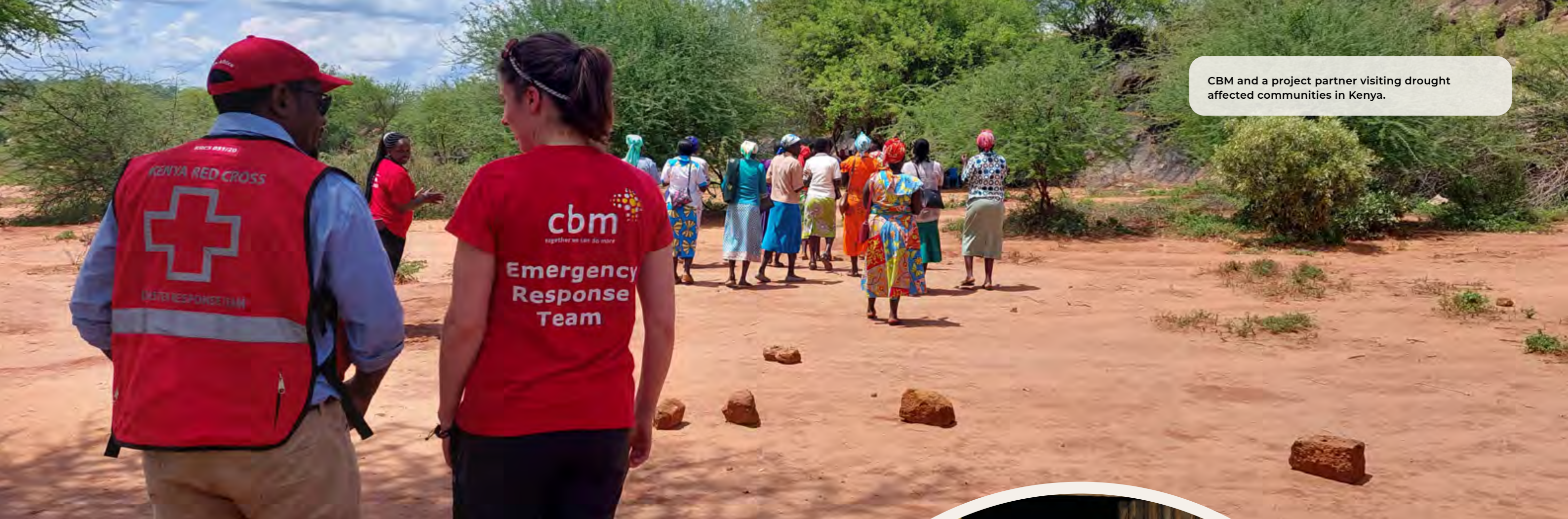
CBM and a project partner visiting drought affected communities in Kenya.