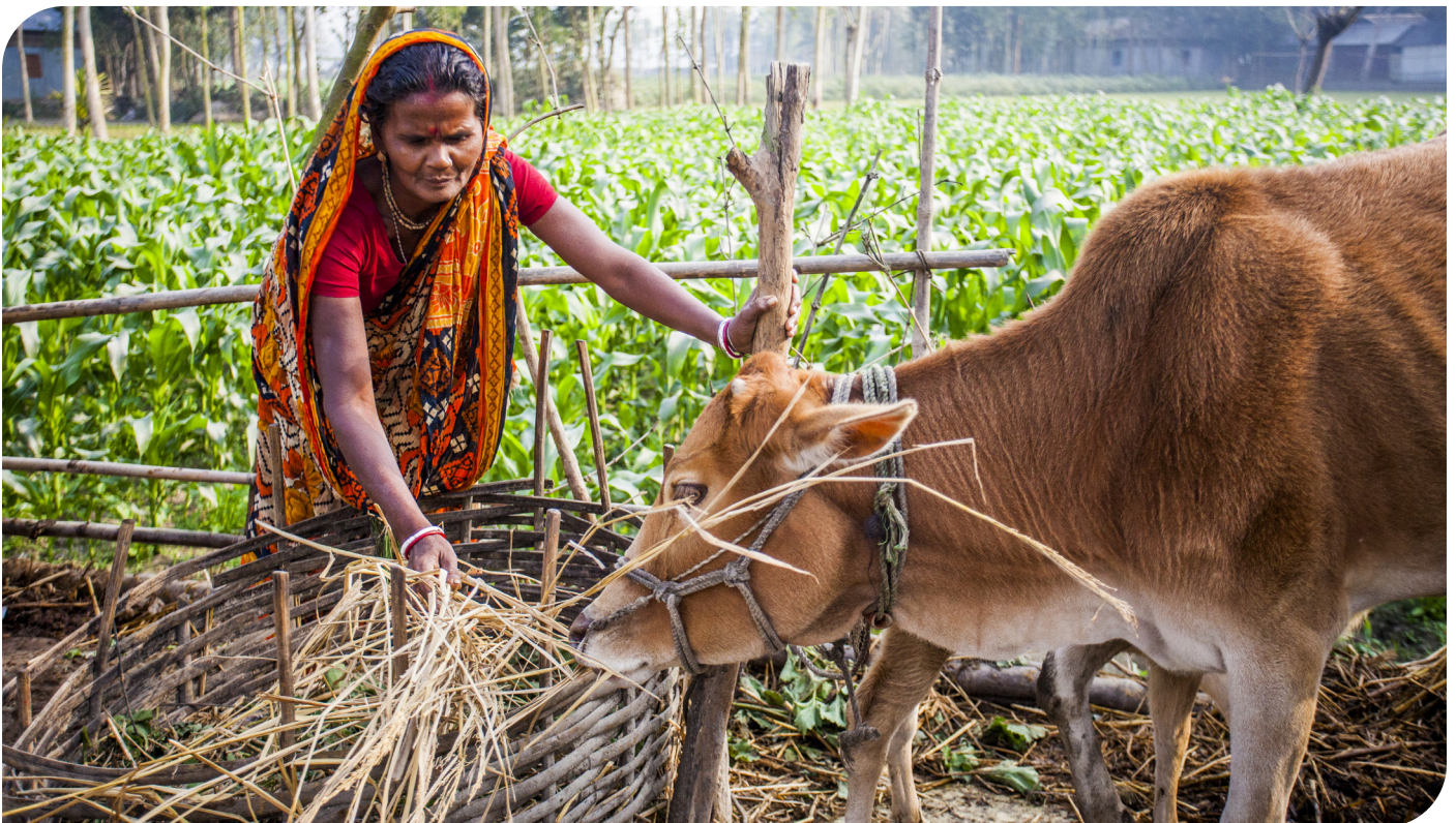
Cow Rearing in Gaibandha city Bangladesh.

In the short term, we will prioritise supporting training, confidence building and effective networking of country teams, member teams, OPD partners and climate activists using platforms for e-learning as a basis. In the longer term, in partnership with OPDs, we will utilise CBM Global emerging programmatic work to highlight good practice and solutions that can work and can be scaled up. We will continue to invest our financial and human resources into learning networks supporting OPDs to learn and grow in climate technicalities.