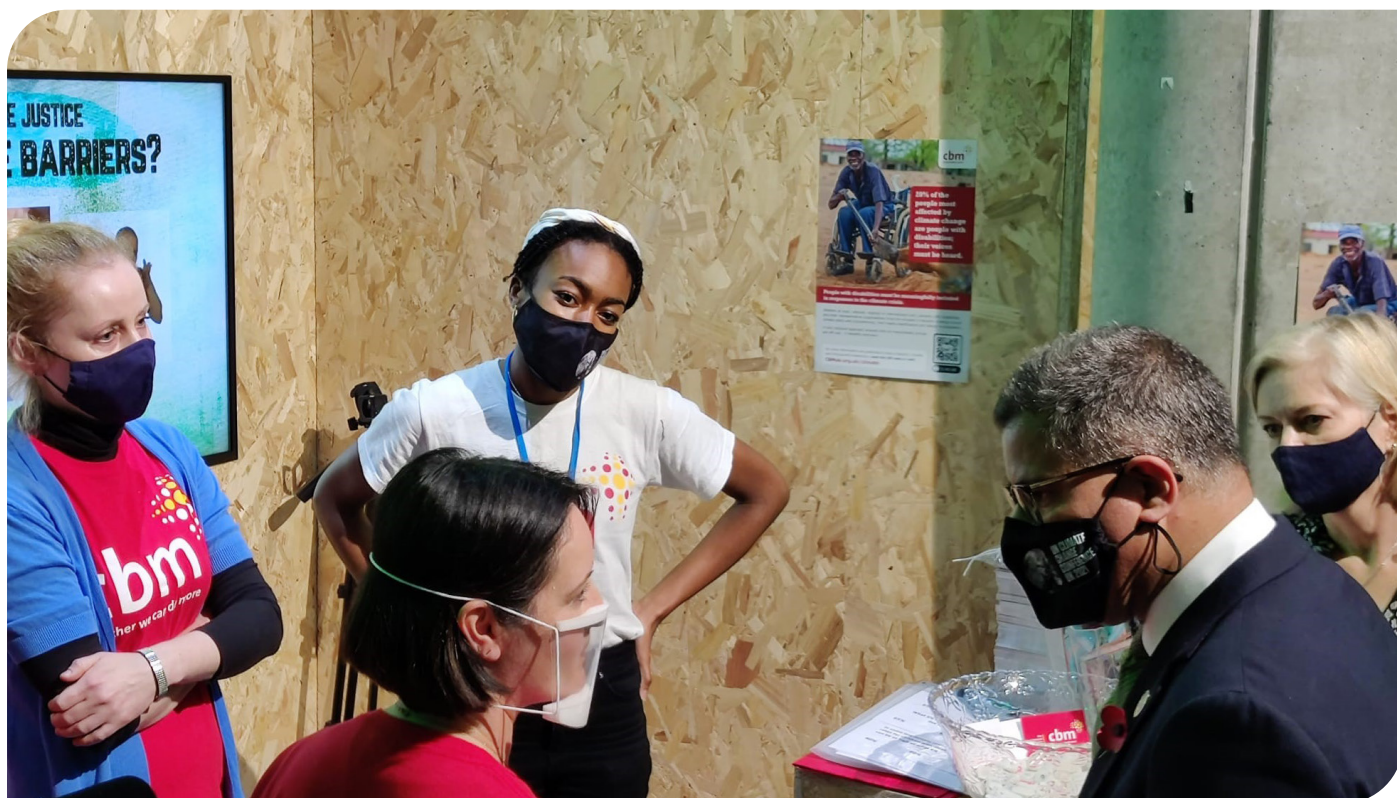
CBM UK's Ursula Grant speaking to Alok Sharma President COP 26 at CBM UK stall in the Green Zone at COP 26.

Climate-related disasters are driving increased levels of risks, vulnerability, and human rights abuses, whilst also disrupting livelihoods, increasing displacement, influencing the spread of diseases, worsening global public health and threatening lives overall. In Mozambique, Malawi and Zimbabwe, more than 1000 people lost their lives in 2019 as a result of Cyclone Idai with millions left destitute without access to foods and basic services. 27 In 2021 Madagascar featured high in the international news as the first country to ever experience a climate induced famine. 28 This growing humanitarian climate emergency requires significant investment in Disaster Risk Reduction (DRR), and humanitarian programmes that boost the resilience and adaptive capacities of vulnerable communities and at risk groups such as persons with disabilities, and ensure they receive climate adaptation funds to manage the risks they face. The participation of people affected by climate change will be critical to ensure responsive, accountable and effective DRR and humanitarian programming. Unless policy and prevention and mitigation measures are put in place, climate change will continue to be a leading driver of humanitarian need. The participation of and support to persons with disabilities and their representative organisations in all decisions affecting the enjoyment of their rights in crisis situations in equal measure to others is a precondition to ensuring climate justice. 29