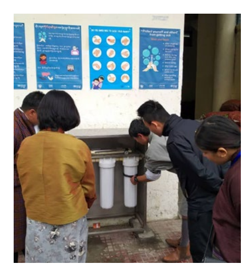
Handing over handwashing station in Bhutan

8 For more information on women and girls with disabilities, see: International Disability Alliance (2020) COVID-19: Women and Girls with Disabilities <a href="https://www.internationaldisabilityalliance.org/Covid19-women">https://www.internationaldisabilityalliance.org/Covid19-women</a>