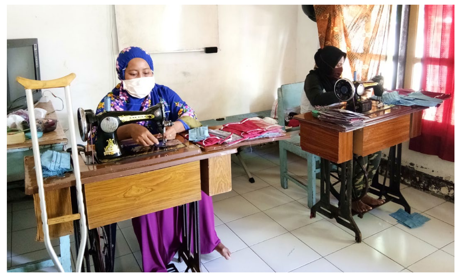
In Indonesia, Yayasan Plan International Indonesia's established relationships with DPOs has supported business adaptation to meet their own demand for personal protective equipment. This small business, which employs many people with disability, is now providing masks for Plan to use in communities as part of their COVID-19 response