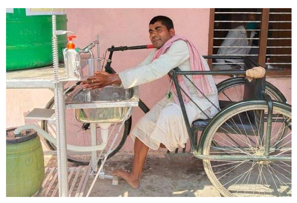
Adapted handwashing station, one of many that SNV installed in three rural municipalities in Sarlahi, Nepal as part of their COVID-19 response

4 Universal design principles help to guide the process of design so that products, environments or communications are usable to the greatest extent possible by all people. For further guidance, refer to DFAT's Accessibility design guide: Universal design principles for Australia's aid program.