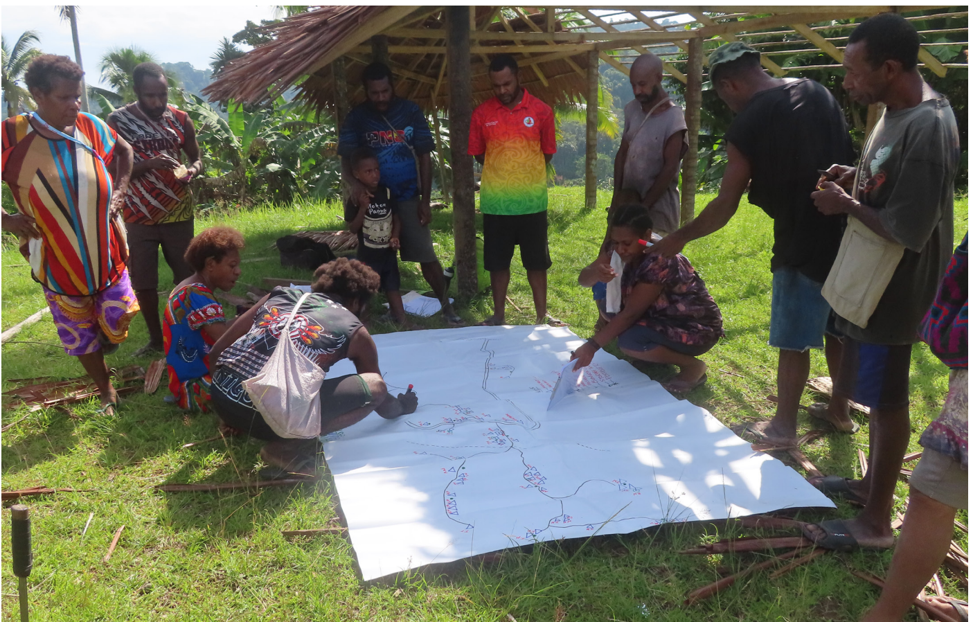
Community WASH project scoping at Walandoum, Papua New Guinea, as part of WaterAid's Water for Women project