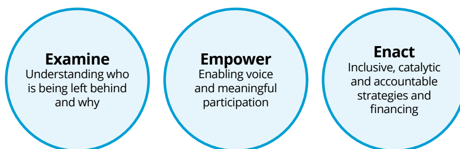
Figure 1. The three mutually reinforcing levers to ensure no-one is left behind

Several frameworks can help WASH practitioners unpack multiple and compounding sources of marginalisation and discrimination that reduce WASH access. The United Nations Development Programme’s (UNDP) conceptualisation of LNOB identifies three ‘mutually reinforcing levers’ of Examine , Empower and Enact (Figure 1) (UNDP, 2018). ‘Examine’ refers to identifying ‘who’ is being, or at risk of being, left behind and why. In the context of LNOB, ‘empower’ means to enable the voice of disadvantaged people to be heard through meaningful participation. ‘Enact’ means to develop and accomplish inclusive strategies and approaches. LNOB approaches in many cases focus on shifting social norms and aim for transformative impact.