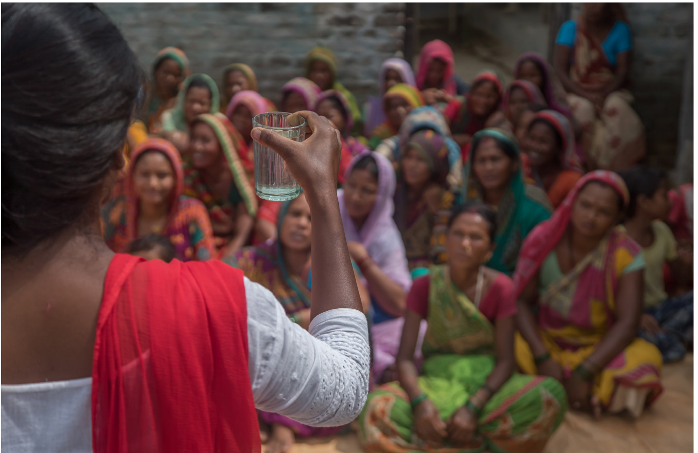
Sanitation demand creation in progress in Malhaniya, Saptari, Nepal

Reflecting their mandates, CSOs are often at the forefront of providing WASH services that reach the most marginalised in society, working towards the achievement of the United Nations Sustainable Development Goal 6 (SDG6), ensuring availability and sustainable management of water and sanitation for all. CSOs' work ranges from advocacy for the rights of marginalised people to provision of WASH services to those who lack them. Through their direct work with communities, local authorities and the private sector, CSOs have deep insights into the challenges disadvantaged groups face and the systemic changes required to overcome them.